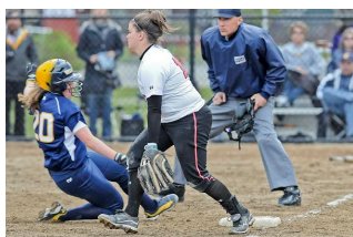
Jerry Forkner, Seattle Metro