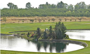
Apple Tree Golf Course